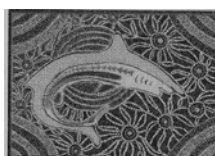
Design: Kathleen Morcome

Language classes will start this Thursday which will include Aboriginal students only. These classes will be during the morning session covering Kindergarten to year 6.