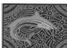
Design: Kathleen Morcome

Our Yr 3-6 camp has been booked and will take place from 18-22 November 2013. A $50.00 non-refundable deposit should now have been paid to confirm seats. Please refer to the payment plan sent home by Mrs Clapson in week 4. Point Wolstoncroft Excursion Payment Plan $355.00 per person