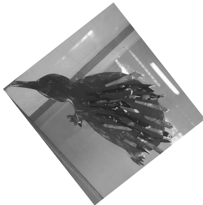
Mikiri is the Aboriginal word for.....?