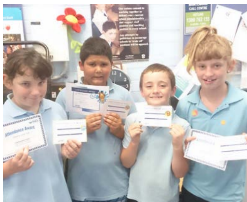
Week 3 Term 1 Winners

Our core school values for all students are Be Safe, Be Respectful and Be Proud . These core values are taught in all school settings by all staff at all times.