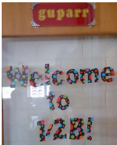
Guparr's Colourful Welcome!