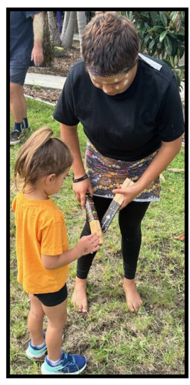
Our Aboriginal Dance Group was also invited to dance at the opening of the Stage 2 building at First Steps Count on Tuesday 5th March 2024.